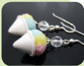
Rainbow Shave Ice Dangle Earrings $20.00