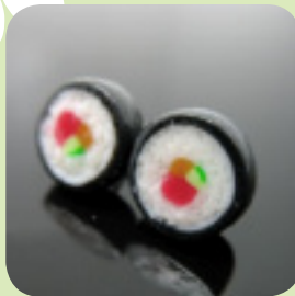
Sushi Post Earrings $10.00