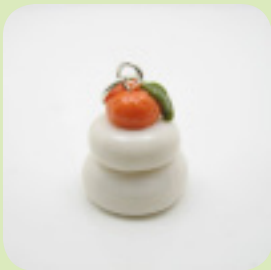
Kagami Mochi Charm $10.00