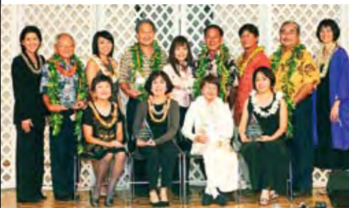
Celebration of Leadership and Achievement Dinner

10/12: Oahu Teacher Institute Day (Community Outreach)