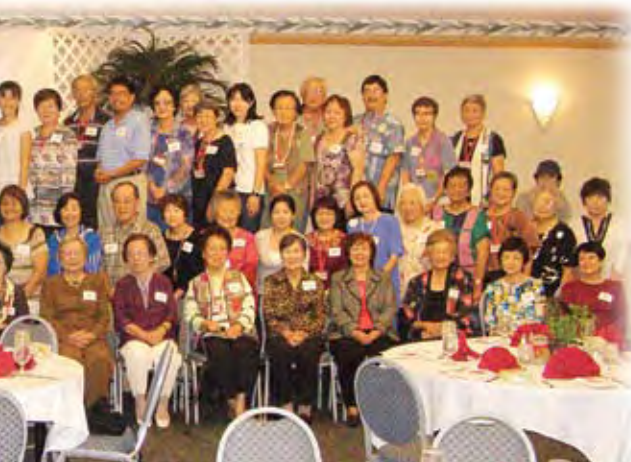
2010 Volunteer Appreciation Luncheon

Revenue for the past fiscal year was $2,318,064, resulting in a positive operating surplus of $389,673 over operating expense of $1,928,391 net of non-cash depreciation of $620,555. Including investment portfolio performance and non-cash depreciation the Cultural Center booked an operating deficit of ($155,744) for the year. However both revenue and expense operating results were very close to what was budgeted.