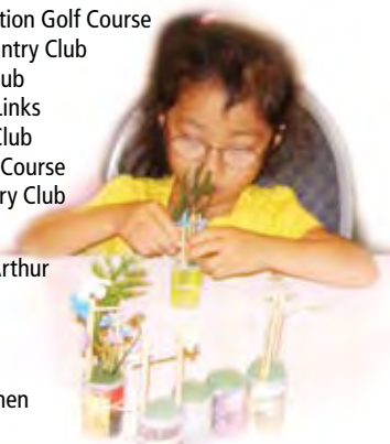
Kodomo no Hi

Bay View Mini Putt Brian Y. Sato Photography Dean Kashiwabara Physical Therapy Hawaii Prince Hotel Waikiki Hertz Corporation Japan Karate Shotokai Hawaii Jujube Holistic Clinic