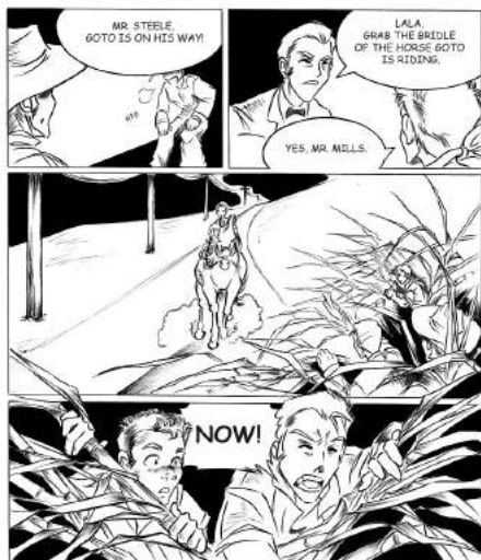
Hamakua Hero: A True Plantation Story , Written by Patsy Iwasaki and Illustrated by Avery Berido: Courtesy of Bess Press