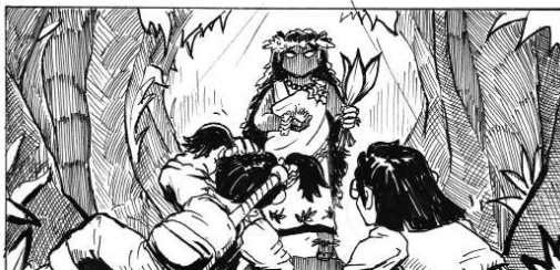
Cacy & Kiara and the Curse of the Ki'i by Roy Chang: Courtesy of BeachHouse Publishing