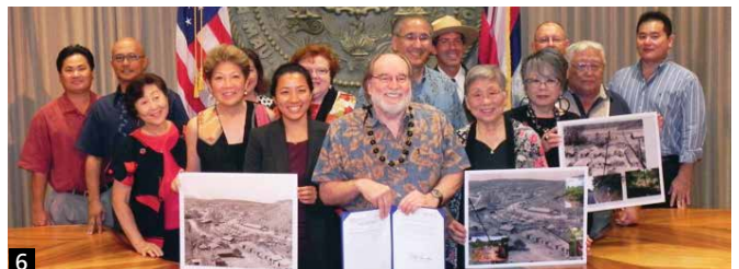
6. Community representatives and legislators with Governor Neil Abercrombie at the signing of Senate Bill 2678 creating a state advisory committee on Honouliuli.