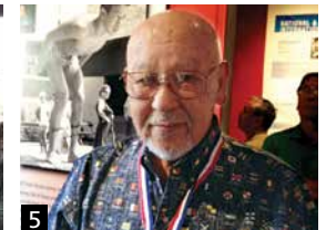
5. Olympic Gold Medalist Ford Konno at the opening of the exhibition Pride of Hawai’i: Japanese American Amateur Athletes .