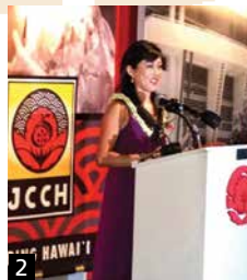
2. Olympic Gold Medalist Kristi Yamaguchi announces her support for the JCCH Discovery Box Program with the presentation of a $10,000 check from her Always Dream Foundation.